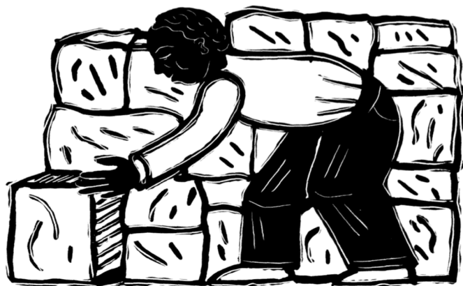
THE STONE WHICH THE BUILDERS REJECTED